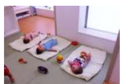
Mattresses for babies