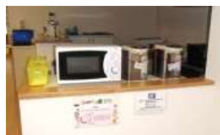
Hot water and Microwave oven